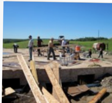
BIKERS TO THE RESCUE