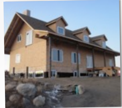
THE LODGE TODAY!