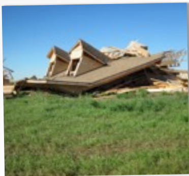
JULY 18, 2011 AFTERMATH

July 18, the ranch lodge was destroyed by a terrible storm and we were left with a pile of rubble where only hours before was a constructed lodge. As we did the only thing we could do, we drew nearer to our Lord and Savior for strength and understanding to carry us through this time. We seemed to have paid so much for insurance but it was not adequate for this type of disaster. So after two weeks of meetings and inspections we needed to move ahead.